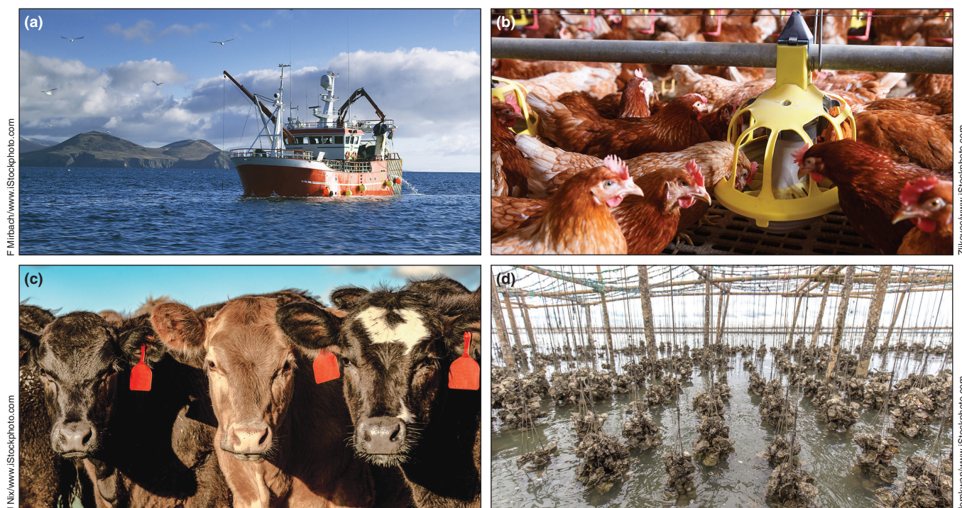
Figure 3. Animal source foods are generated from a wide variety of production methods, including capture fisheries (a), livestock (b and c), and oyster aquaculture (d).

Chilean facilities use large amounts) as well as between livestock production systems (WebTable 8). No antibiotics are used in capture fisheries and mollusk aquaculture.